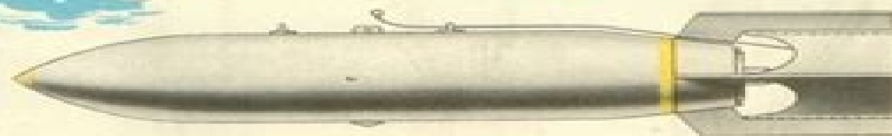
AN-Mk1 1600-LB. AP BOMB