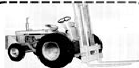
Figure 2 - Right Hand Front View Fork Lift