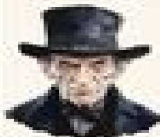
Ebenezer Scrooge A miserly and cold-hearted businessman.