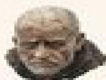
Jacob Marley Scrooge's deceased business partner.