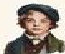
Tiny Tim Bob Cratchit's ill but optimistic son.