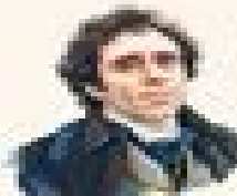
Bob Cratchit Scrooge's underpaid and overworked clerk.