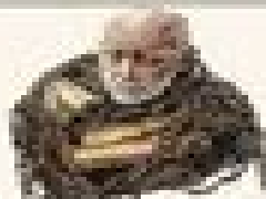
The Chains of Jacob Marley Represent the consequences of a life focused on greed and neglect.