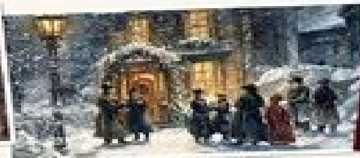
Setting: Victorian London