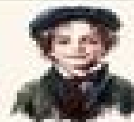
Tiny Tim A symbol of innocence, hope, and the consequences of neglecting the poor.