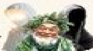
The Three Ghosts Reveal the Past, Present and Future to Scrooge.