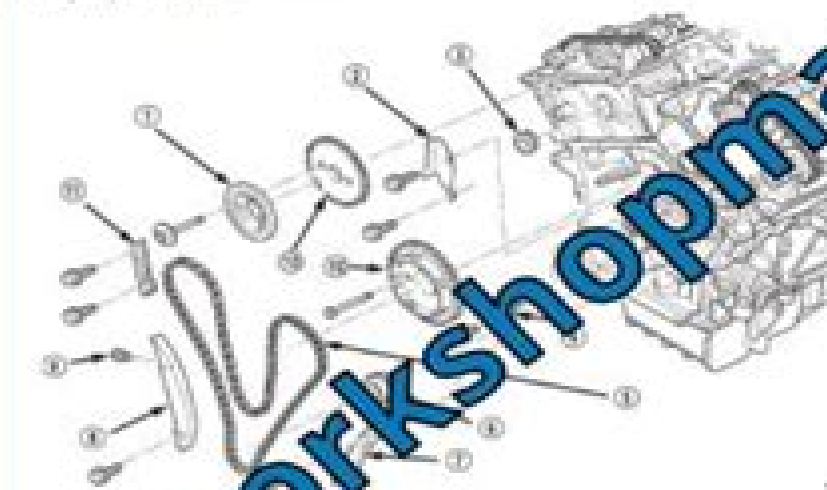
Fig. 56 Primary Timing Drive System

(4) Install rocker arm in original position of removal over valve and lock adjuster. Release tension on valve spring.