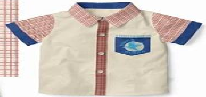
Campus buttons_ray flower