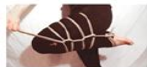
Step 10: reverse again, this time going over the thigh