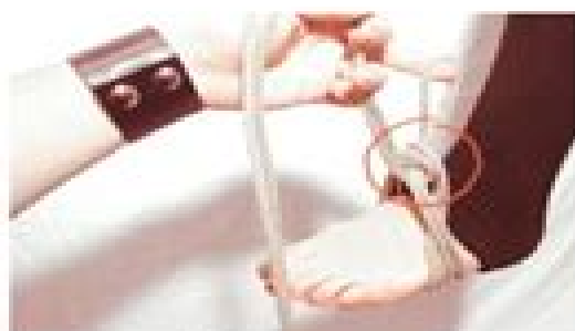
Step 4: tie an over-hand knot through all coils, as shown