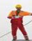
Retract Boom 2