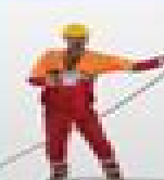
Extend Boom 2