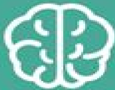
Cognitive ability tests