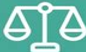
Situational judgment assessments