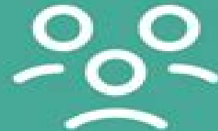
Personality and culture assessments