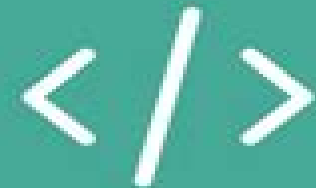
Software skills tests