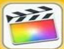
Final Cut Pro