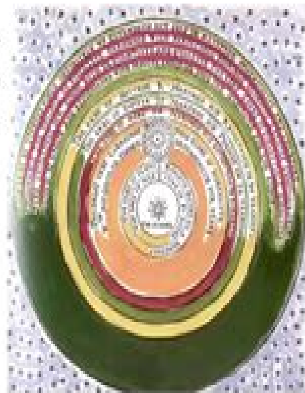
Digges, A Perfect Description of the Celestial Orbs , 1576

Infinite universe filled with stars: PARADOX!