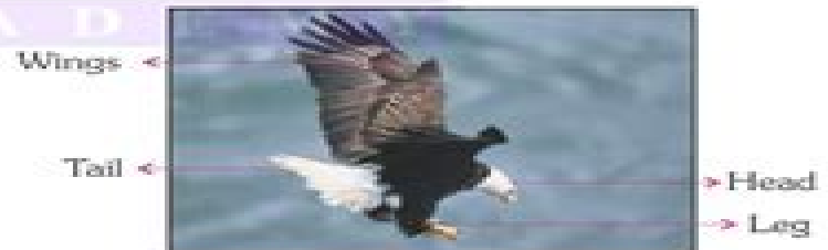
Body parts of a bird