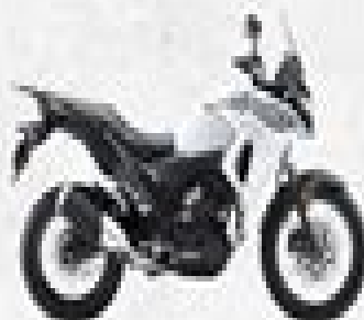
Kawasaki Versys-X 300 ABS