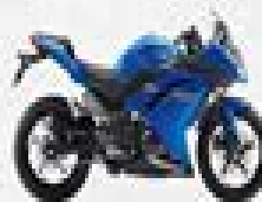
Kawasaki Ninja 300 ABS