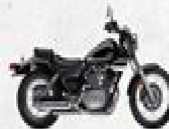
Yamaha V Star 250 Raven