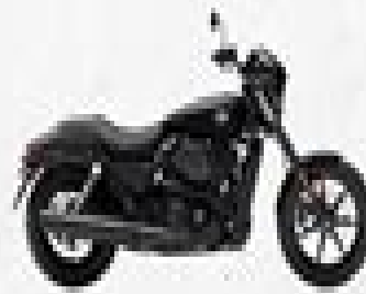
Harley-Davidson Street 500