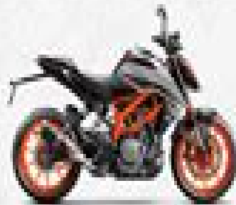
KTM Corner Rocket (390 Duke)