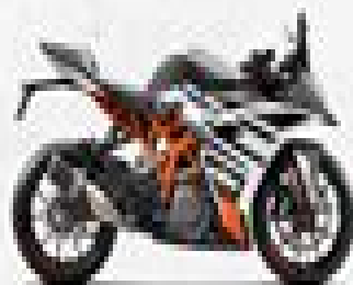
KTM RC 390