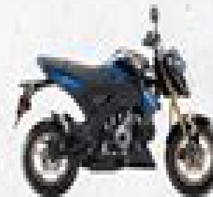
Kawasaki Z125 Pro SE