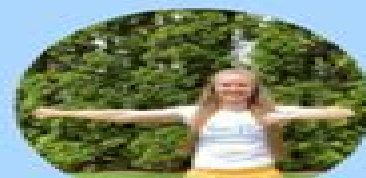
BOW & ARROW