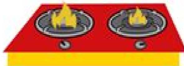
Combustion of propane