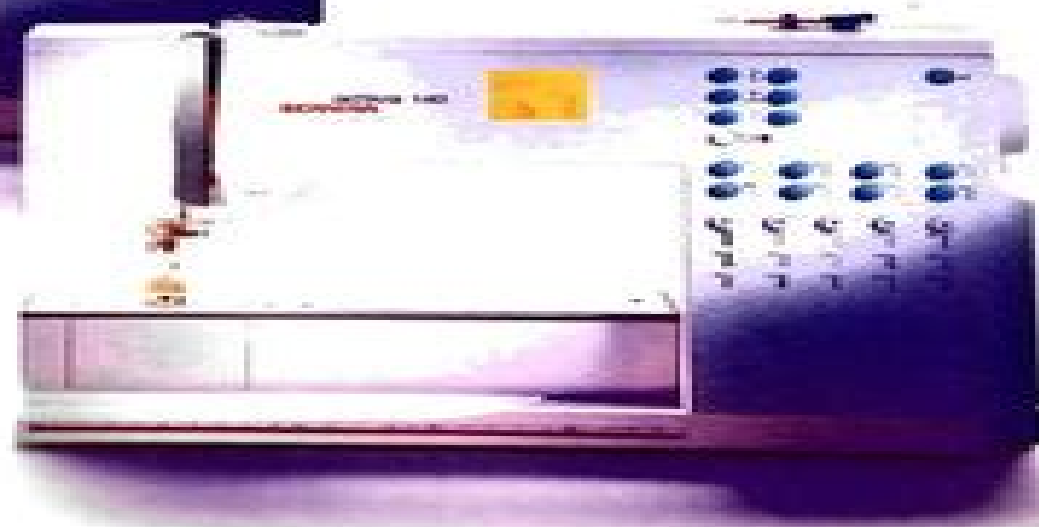
activa 140 BERNINA Made in Switzerland