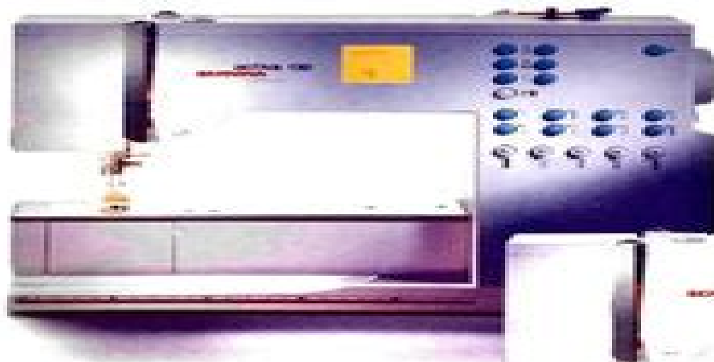
activa 130 BERNINA Made in Switzerland