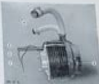
Fig. 2-16. Water pump and drive. (A) Impeller, (B) Drive shaft, (C) Pump housing.

When looking at the pump, the water level should be at the top of the tank. The water level should be at the top of the tank.