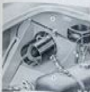
Fig. 2-15. Water pump and drive. (A) Impeller, (B) Drive shaft, (C) Pump housing.

Remove the oil from the drive shaft of the pump. The oil should be at the top of the tank. The oil should be at the top of the tank.