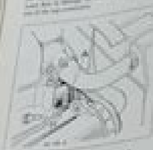
Fig. 2-13. Water pump and drive.

Figure 2-13 shows the water pump and its drive. The pump is mounted on the front of the engine and is driven by the crankshaft. The pump is connected to the radiator by hoses. The pump is also connected to the water passages in the engine block and head.