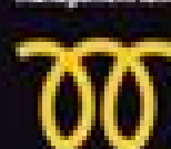
Engine management lamp