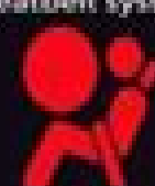
Airbag and seatbelt system