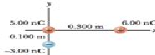
Figure P23.11 Problems 11 and 35.