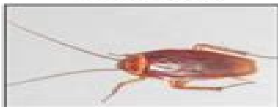
Cockroach breathing with air holes.