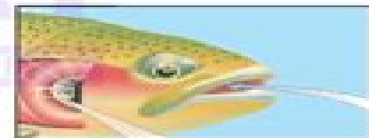
Fish is breathing with gills