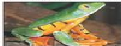
Frog is breathing with skin in water.