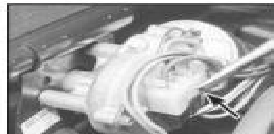
20.6 Releasing the wiper motor electrical plug