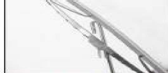
19.1 Removing a wiper blade from its arm