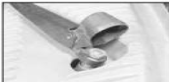
19.3 Wiper arm retaining nut