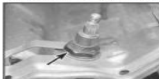
20.4 Wiper spindle clamp nut (arrowed)