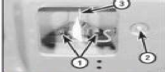
16.8 ... to gain access to the boot latch nuts (1), servo unit mounting screw (2) and the manual release control rod (3)

disconnect its wiring plug and remove it. 9 Refitting is the reverse of removal.