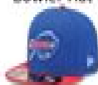
Bill Or Visor