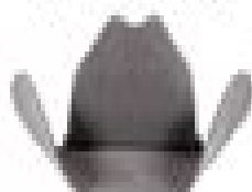
Kettle Brim Hat