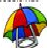
The Umbrella Hat