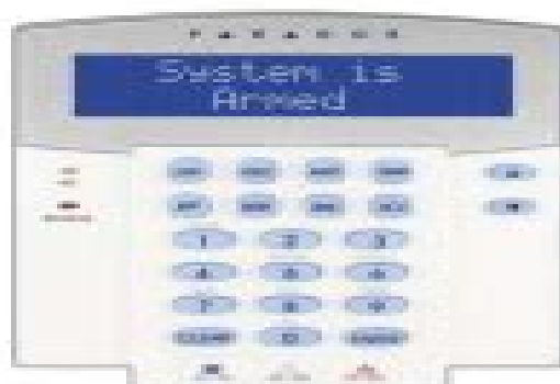
EVO641 / EVO641R DGP2-641BL / DGP2-641RB