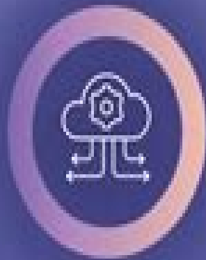
Master data management