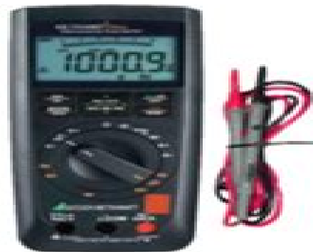
Figure 2: Metra hit TECH Multimeter