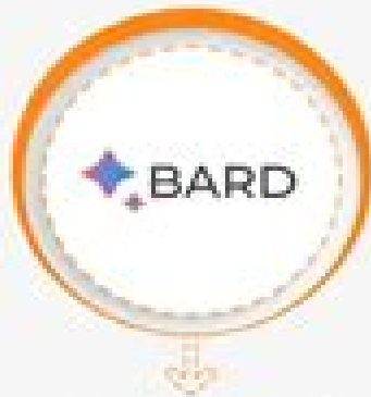
Google Bard & Duet