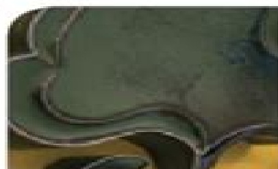
1 Green Breaks Blue glaze