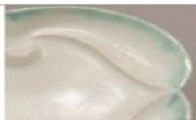
3 Liz White with Green Glaze on rim