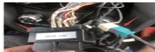
9.After taking out the host, plug the car power harness and white radio antenna into the female end of android power harness and the female end of the radio antenna.