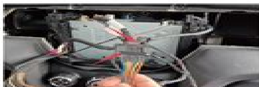
10.Plug the car air conditioner into the Android air conditioner female plug.