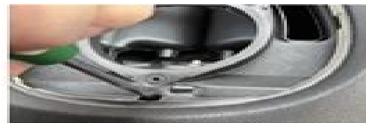
6.Insert a flat-blade screwdriver into the small round hole above the center speaker and push it down to remove the original car screen.