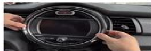
3.Pry out the panel decorative ring.