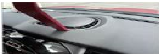
5.Pry out the center speaker protective cover.