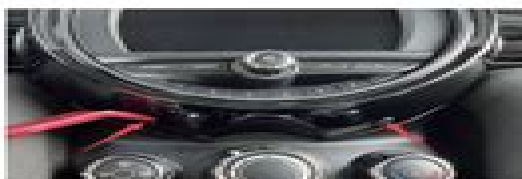
2.Take out the panel decorative ring buckle.