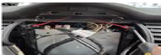
8.Use a T20 screwdriver to remove the left and right screws and remove the Original HOST.