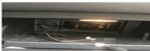
11.Lead the Android's GPS antenna, USB cable, and 4G antenna out of the passenger glove box.