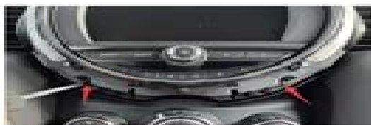
4.Use T20 to remove the host panel screws.