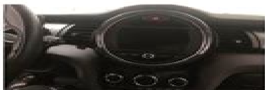
1.Original Monitor(Power off before installation).