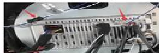
12.Connect well all the wires and connect well the CAN BUS protocol cable.