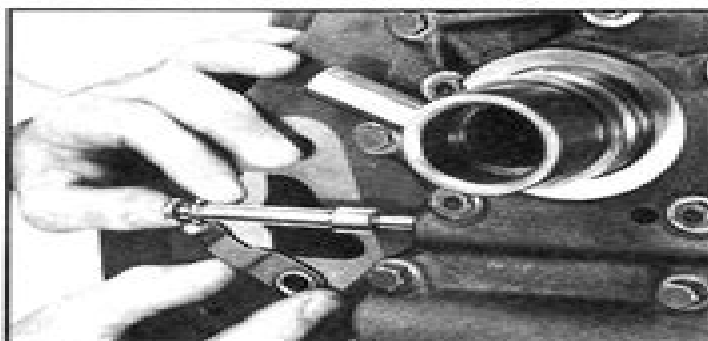
Fig. 118—Indexing Manual Valve with Lever