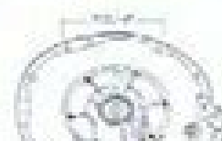
Chrysler TH-727 & 904, 373, 318, 340, 360