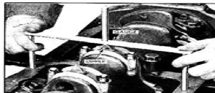
Fig. 23—Checking Connecting Rod Dipper Height