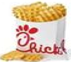
Med Waffle Fries

280 Calories 14g Fat 33g Carbs 4g Protein