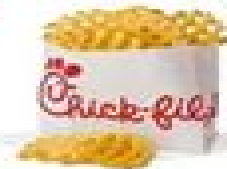
Small Waffle Fries

140 Calories 3.5g Fat 2g Carbs 25g Protein