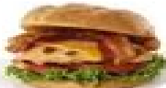
Grilled Chicken Club

310 Calories 6g Fat 36g Carbs 29g Protein