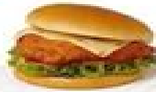
Spicy Deluxe Sandwich

430 Calories 17g Fat 41g Carbs 38g Protein