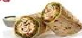
Grilled Chicken Cool Wrap

490 Calories 19g Fat 44g Carbs 38g Protein