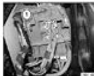
Fig. 11: Removing Receiving Antenna

Gently press crumpled tube apart in direction of arrow and remove receiving antenna (2).