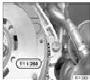
Fig. 18. Using Special Tool 11 9 200 On Flywheel

Block flywheel with special tool 11 9 200