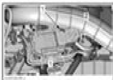
FIGURE 5 5. Disconnect both engine harness connectors (HFC)