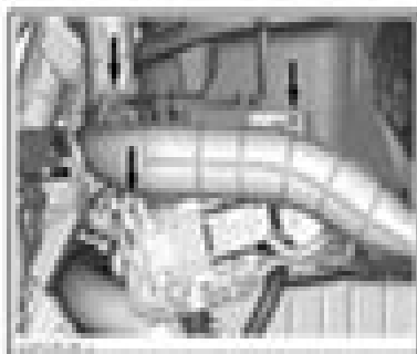
FIGURE 4 4. Remove ECM retaining screws