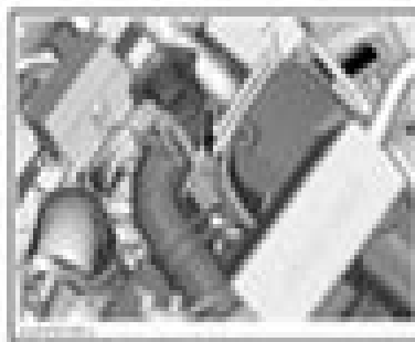
FIGURE 7 7. Remove air intake tube retaining screw