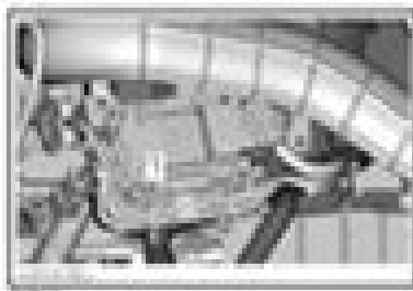
FIGURE 6 6. Remove air intake tube retaining screw