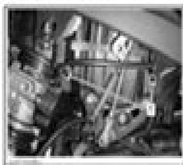
FIGURE 10 10. Detach gearshift vent hose from air filter housing