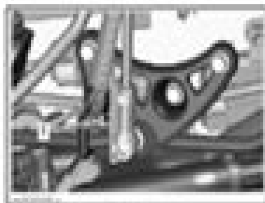
FIGURE 9 9. Detach air intake tube from shift lever