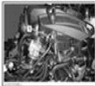
FIGURE 8 8. Carefully move link rail forward