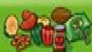
Fresh, frozen or canned vegetables 175 ml (3/4 cup)