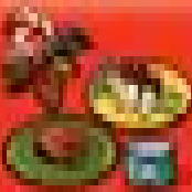
Cooked fish, shellfish, poultry, lean meat 75 g (2 1/2 oz) or 125 ml (1/2 cup)