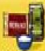
Cooked rice, bulgur or quinoa 125 ml (1/2 cup)