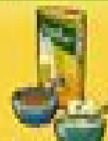
Cereal Cooked: 25 g Raw: 175 ml (3/4 cup)