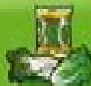
Leafy vegetables Cooked: 125 ml (1/2 cup) Raw: 200 ml (1 cup)