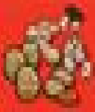
Shelled nuts and seeds 60 ml (2 tbsp)