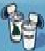
Yogurt 175 g (3/4 cup)