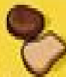
Bread 1 slice (30 g)