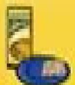
Cooked pasta or noodles 125 ml (1/2 cup)