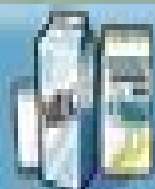
Milk or powdered milk (reconstituted) 250 ml (1 cup)