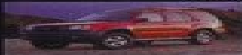
2001 NISSAN XTERRA