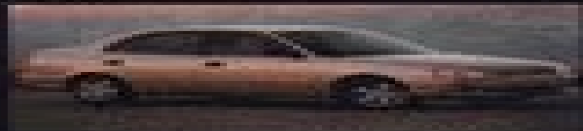
2001 HYUNDAI ACCENT

This guide provides you with all the information you need to make the best choice among the 230 models sold between 1996 and 2001. It outlines the pros and cons, the recalls and the major reliability problems of each model.