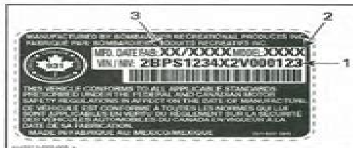
TYPICAL — VEHICLE IDENTIFICATION NUMBER LABEL 1. VIN (Vehicle Identification Number) 2. Mfg. No. 3. Manufacturing date