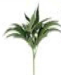
Phase 1 cut