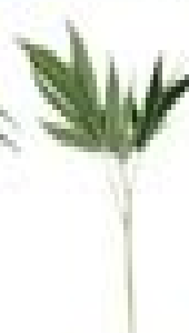
Phase 2 cut