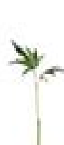
Phase 3 cut