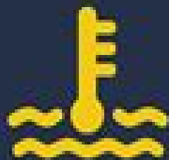
Engine Temperature Warning Symbol