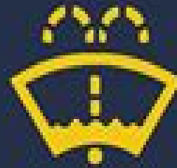
Windshield Washer Fluid Light