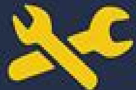
Engine Service Symbol