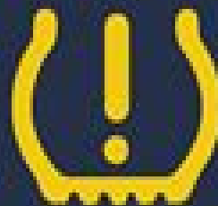
Tyre Pressure Warning Symbol