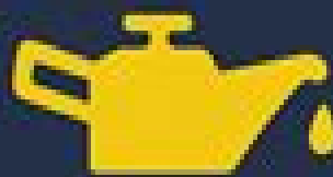
Engine Oil Pressure Warning Symbol