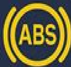
Anti-lock braking System (ABS) Warning Light