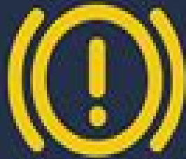
Hand Brake Warning Light