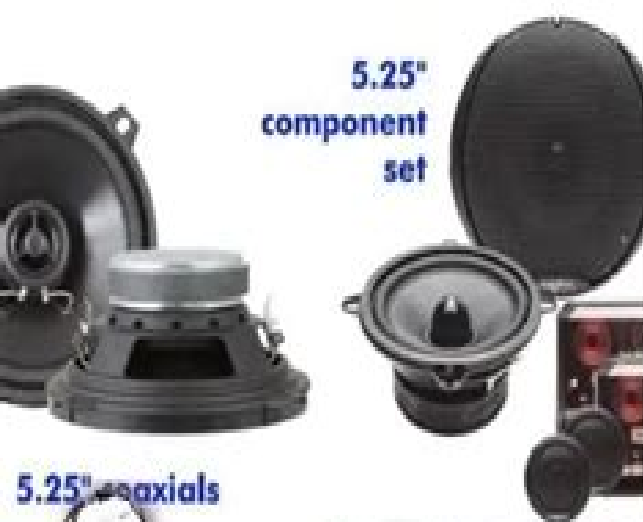
5.25" component set