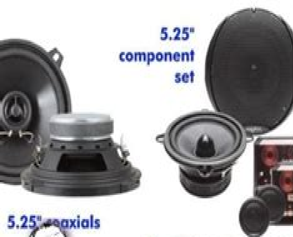
5.25" component set