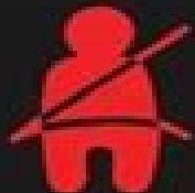
Seat Belt Reminder Light