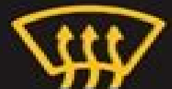
Rear window defrost