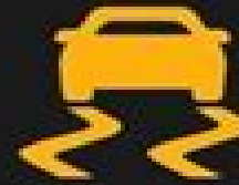
Traction Control Light