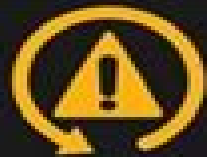
Traction Control Malfunction Light