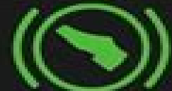
Automatic Shift Lock or Engine Start Indicator Light