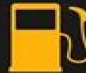
Low Fuel Indicator Light