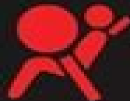
Airbag Indicator Light