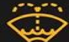
Washer Fluid Indicator Light