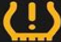
Tire Pressure Warning Light