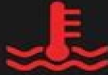
Engine Temperature Warning Light