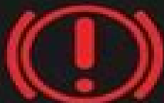
Brake Warning Light