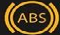
Anti-lock Braking System (ABS) Warning Light