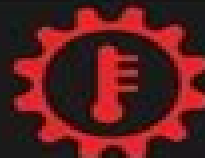
Transmission Temperature Warning Light