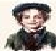
Tiny Tim A symbol of innocence, hope, and the consequences of neglecting the poor.