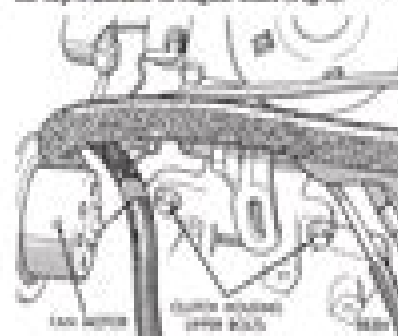
Fig. 3 Remove or Install Bolts

When removing or installing the transaxle, it may be helpful to use locating pins to place of the top transaxle to engine bolts (Fig. 3).