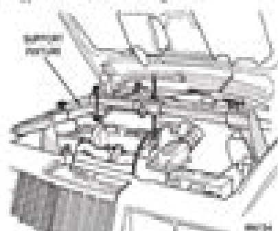
Fig. 1 Engine Support Fixture