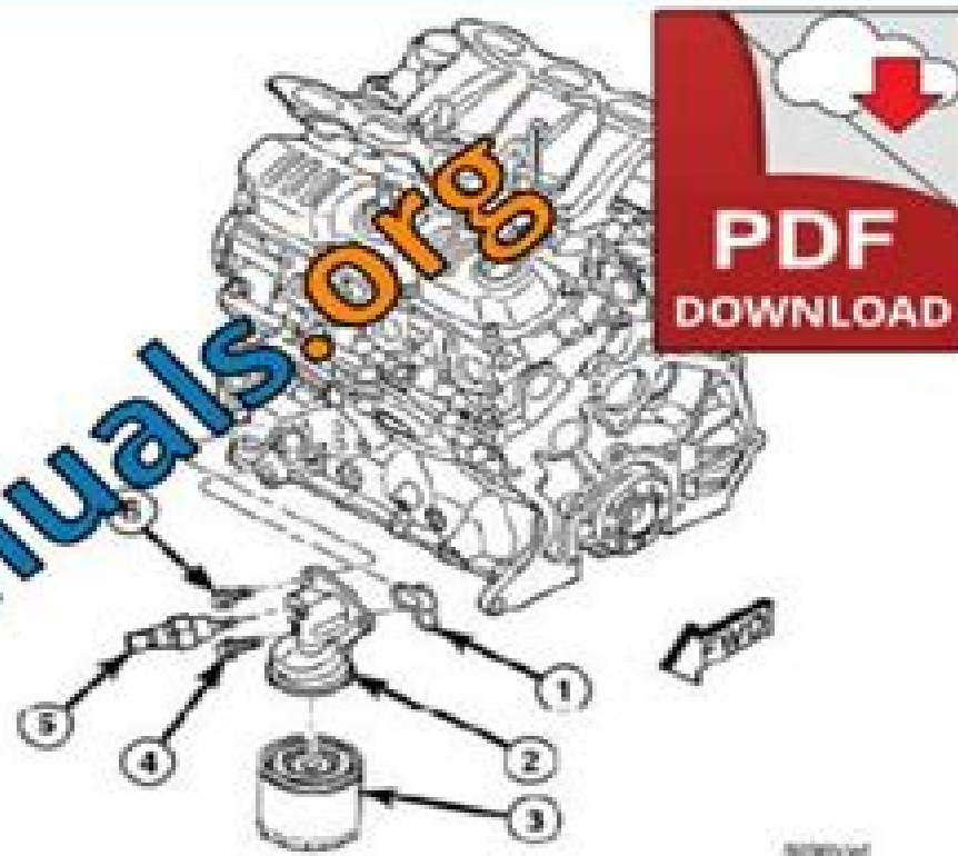
Fig. 156: Removing/Installing Oil Filter Adapter