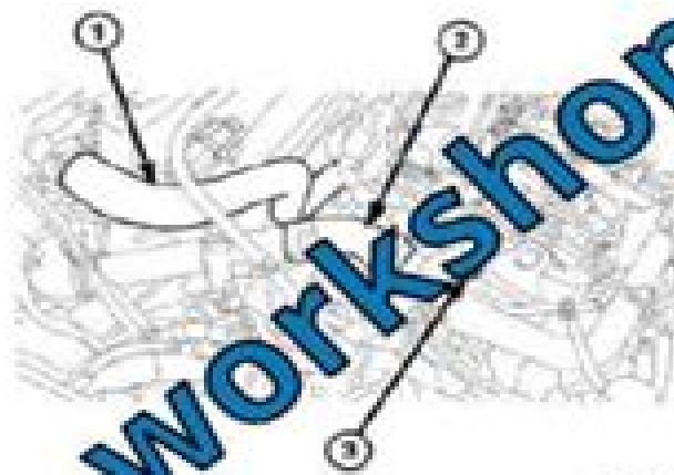
Fig. 8: Charge Air Cooler Hoses