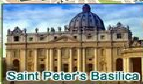
Saint Peter's Basilica