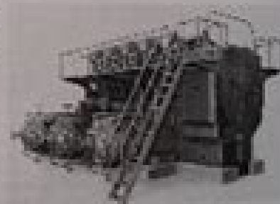
The Dodge engine is a masterpiece of engineering, and its design is the result of years of experience and research.

The Dodge engine is a masterpiece of engineering, and its design is the result of years of experience and research. It is a four-cylinder, four-stroke engine, and its design is the result of years of experience and research.