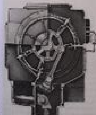
The Dodge engine is a masterpiece of engineering, and its design is the result of years of experience and research.

The Dodge engine is a masterpiece of engineering, and its design is the result of years of experience and research. It is a four-cylinder, four-stroke engine, and its design is the result of years of experience and research.