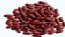
Kidney Beans (Canned)