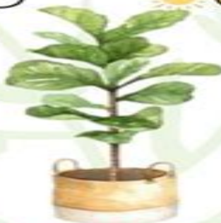
Fiddle Leaf Fig