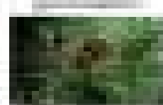
1. The first step is to identify the problem or question that needs to be answered. This involves understanding the context and the specific requirements of the task.